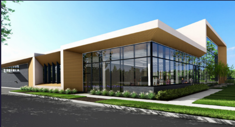
Canal Winchester Branch